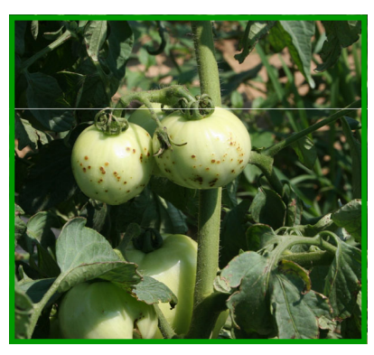
Bacterial Spot on fruit