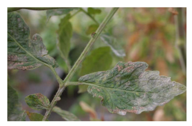
Powdery mildew on tomato foliage

Powdery Mildew (fungus) - Powdery mildew is found mainly on tomatoes grown in greenhouses and high tunnels, but can be found on field-grown tomatoes during dry summers. The disease is characterized by a white, talc-like growth on upper and lower leaf surfaces. Over time, necrotic areas will form, resulting in blighting of affected leaves. Stems may be infected in severe outbreaks. Management includes proper plant spacing, ad- equate ventilation in greenhouses, and fungicide applications.