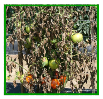
Severe early blight on tomato plant

Early Blight (fungus) - Leaves have dark brown spots with concentric rings or target board pattern in the spots; disease begins on lower foliage and works up with severely affected leaves shriveling and dying; similar spots can occur on stems and fruits; can be confused with other leaf spots, but this is most common. Maintain proper fertility. Spray foliage with fungicide at first sign of disease and as needed (weekly during hot, humid weather) thereafter; use chlorothalonil, mancozeb or fixed copper. Good coverage is needed. Make second planting in midsummer for fall crop. A few early blight tolerant varieties are now available.