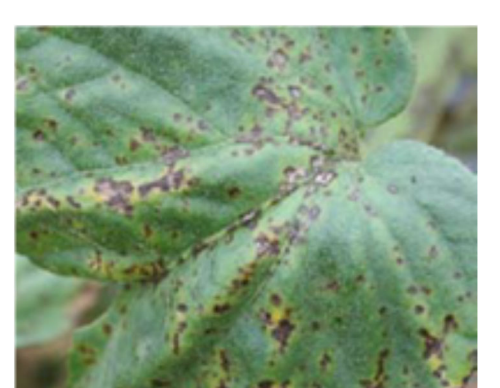
Bacterial spot on foliage

Early Blight (fungus) - Leaves have dark brown spots with concentric rings or target board pattern in the spots; disease begins on lower foliage and works up with severely affected leaves shriveling and dying; similar spots can occur on stems and fruits; can be confused with other leaf spots, but this is most common. Maintain proper fertility. Spray foliage with fungicide at first sign of disease and as needed (weekly during hot, humid weather) thereafter; use chlorothalonil, mancozeb or fixed copper. Good coverage is needed. Make second planting in midsummer for fall crop. A few early blight tolerant varieties are now available.