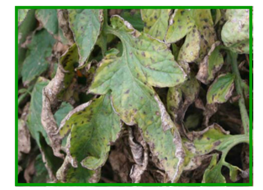
Bacterial spot on foliage