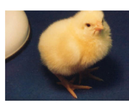
Figure 5. Newly hatched chick.